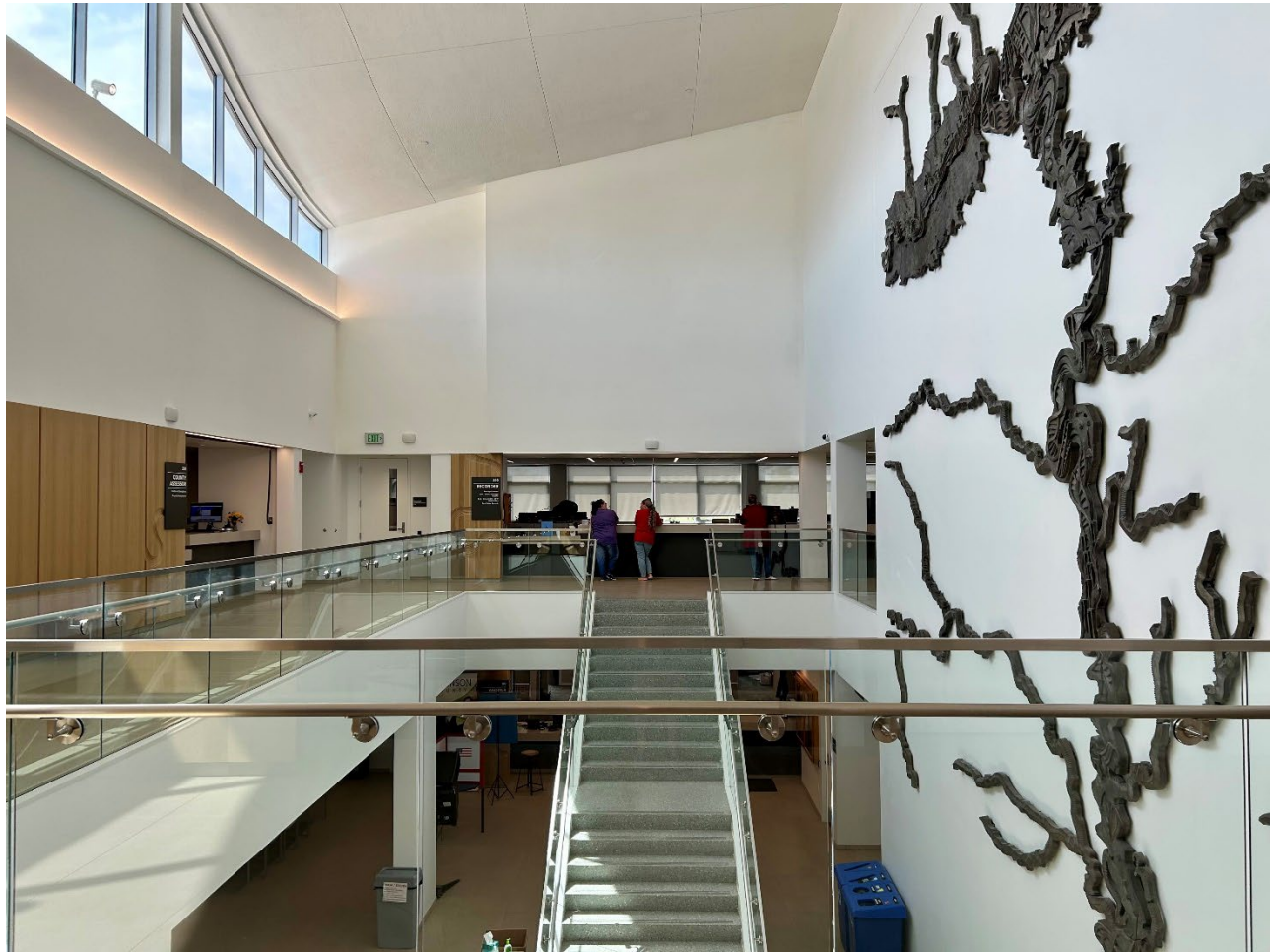
Above: The newly renovated Johnson County Administration Building