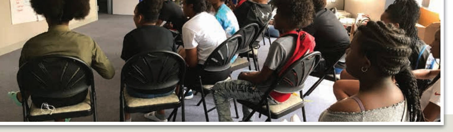
JCPH staff conducting community asset mapping exercise at the Dream Center

Along with Community Health staff, a team of 13 students from the University of Iowa College of Public Health were recruited to assist with data collection. JCPH staff trained students on Community Based Participatory Research methods, the CASPER methodology, and inducted them into the Johnson County Medical Reserve Corps. Students participated in conducting the HealthyJoCo Chats, the CASPER survey, and met weekly with JCPH staff throughout the summer. Training was also provided to the entire JCPH staff who helped conduct HealthyJoCo Chats at the Johnson County Fair and deliver the CASPER survey.