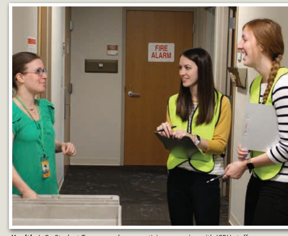
Healthy JoCo Student Team members practicing surveying with JCPH staff

During this first phase of Healthy JoCo, we have collected input from over 1,500 community members located throughout the county and who are diverse among their racial/ethnic, gender, age, and income characteristics. While we have only begun to analyze the data, this project has provided a model for an assessment approach that allows the health department to engage community members in meaningful ways so that JCPH may be appropriately informed as we move forward with our programs and policies.