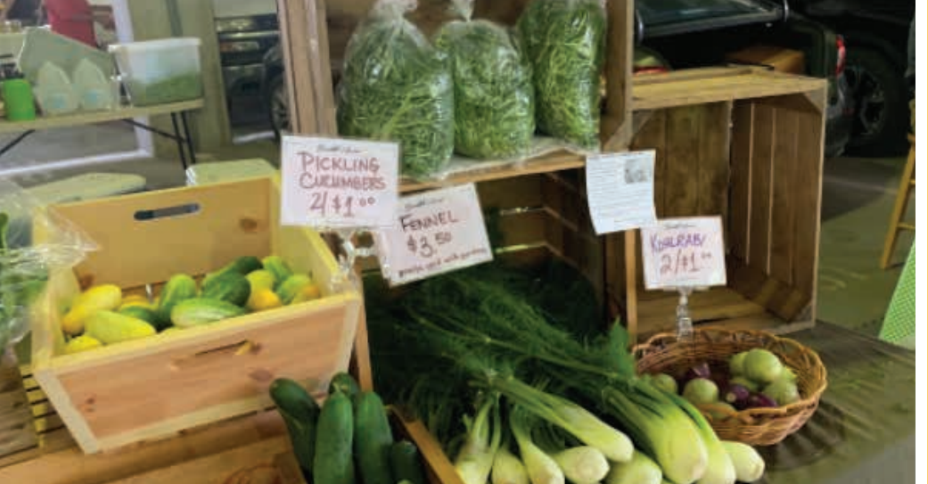
Fresh produce at local farmers' markets is free for WIC families through the Farmers' Market Nutrition Program.