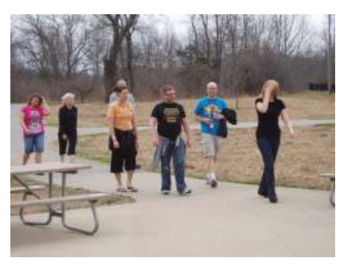
Staff returning from a wellness activity.