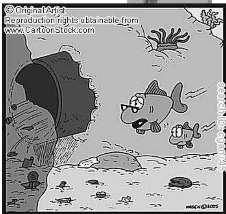
I used to play here as a kid, but of course, that was before Humans built that sewer pipe...

Buried Toxic Wastes -A protest by Love Canal residents, ca. 1978.