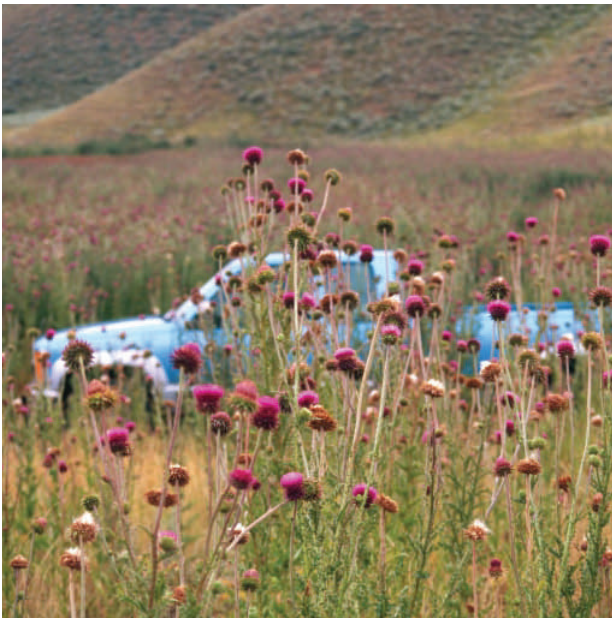
An infestation of Musk Thistle