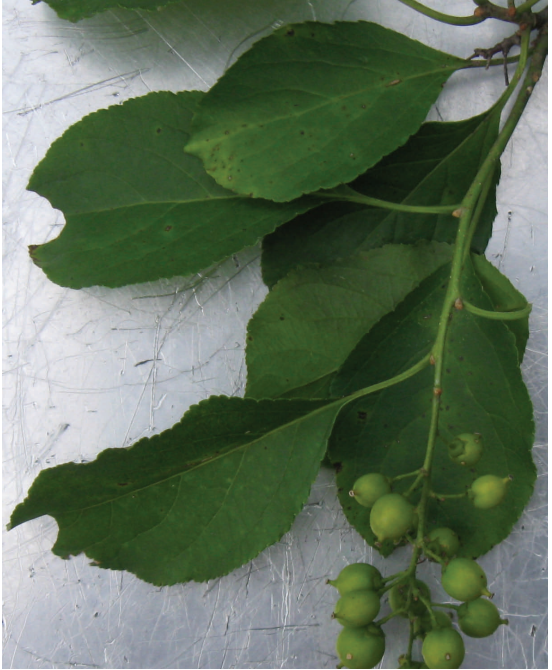
American bittersweet (Celastrus scadens)