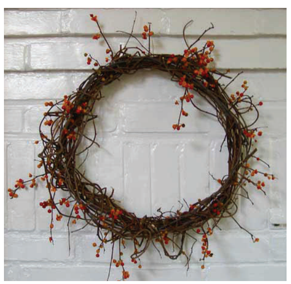
Seeds on wreaths can stay viable for many weeks after being cut. Birds may eat the berries, helping to disperse the seeds. Once thrown away, seeds on wreath may enter the soil and germinate.