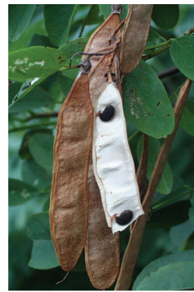
Fruit & Seeds

Jan Feb March April May June July Aug Sept Oct Nov Dec